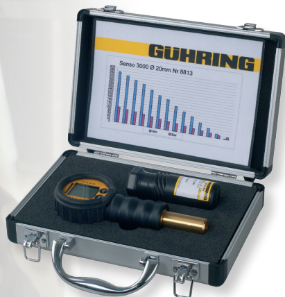
Guhring's Senso 3000 offers a quick and precise measurement of the clamping force of hydraulic chucks.

Hydraulic chucks create clamping pressure by increasing the hydraulic force around the sleeve (in blue), which causes the sleeve to tighten around the shank of the cutting tool. This forms a secure and even grip on the cutting tool in the chuck.